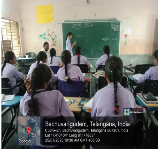
Bachuvarigudem, Telangana, India C58h+j2h, Bachuvarigudem, Telangana 507301, India Lat 17.416404° Long 81.177868° 25/07/2025 10:30 AM GMT +05:30