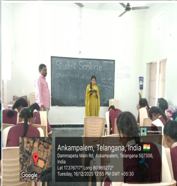
Ankorpalem, Telangana, India 🇮🇳 Dammopeta Main Rd, Ankorpalem, Telangana 507306, India Lat 17.376717° Long 80.965272° Tuesday, 16/12/2025 12:55 PM GMT +05:30