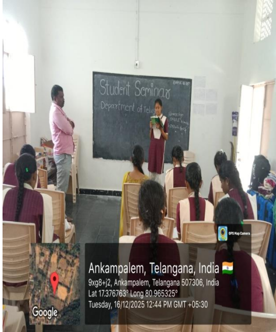
Ankorpalem, Telangana, India 🇮🇳 9xg8+j2, Ankorpalem, Telangana 507306, India Lat 17.376763° Long 80.965325° Tuesday, 16/12/2025 12:44 PM GMT +05:30