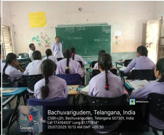
Bachuvarigudem, Telangana, India C58h+j2h, Bachuvarigudem, Telangana 507301, India Lat 17.416403° Long 81.177814° 25/07/2025 10:13 AM GMT +05:30